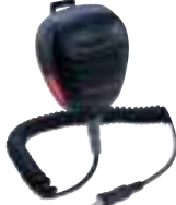
Submersible Speaker-Mic CMP460A (Option)