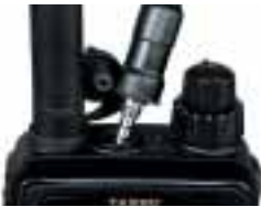
Waterproof Connectors and Microphone Jack